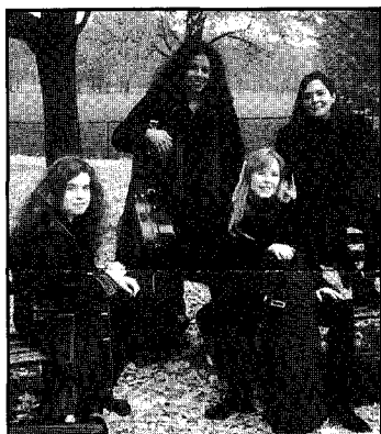
The Lark Quartet

of The Lark Quartet. This classical string quartet is comprised of four remarkable young female musicians who are quickly gaining an international reputation. The Quartet has played at some of the nation's most prestigious halls, and the NOA was proud to