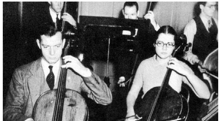
The NOA was among the first to include women in its orchestra.